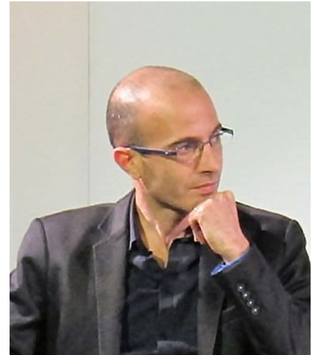
Harari in 2017