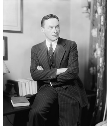
Lippmann, c. 1920