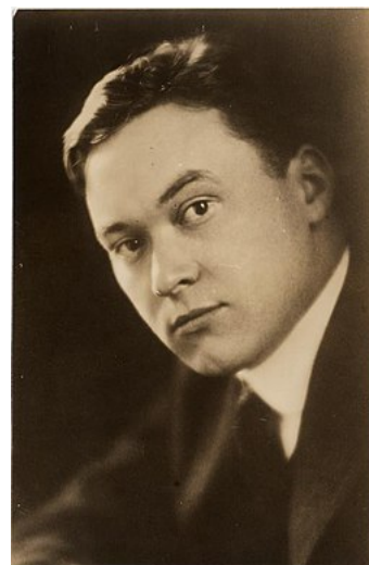
Lippmann in 1914, shortly after the establishment of The New Republic