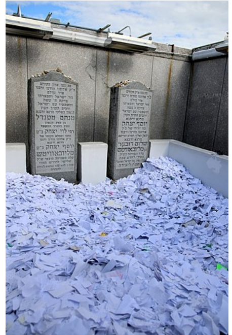
The Rebbe's Tomb: Schneerson's burial place next to his father-in-law and predecessor in Queens, New York

Schneerson placed a strong emphasis on education and often spoke of the need of a moral educational system for all people. He was an advocate of a Department of Education as a separate