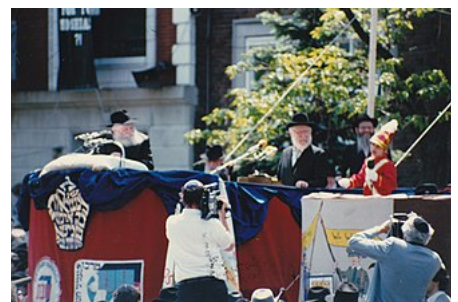
A child announces one of the 12 verses