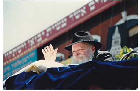
Waving to children at a Lag BaOmer parade

cabinet position from the Department of Health, Education and Welfare . [131] Schneerson proclaimed 1977 as a "Year of Education" and urged Congress to do the same. He stated that education "must think in terms of a 'better living' not only for the individual, but also for the society as a whole. The educational system must, therefore, pay more attention to the building of character, with emphasis on moral and ethical values. Education must put greater emphasis on the promotion of fundamental human rights and obligations of justice and morality, which are the basis of any human society". [132]