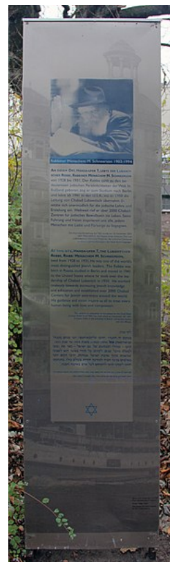
A monument for Schneerson in Berlin

On a visit to Paris in 1947 he established a school for girls and worked with local organizations to assist with housing for refugees and displaced persons . [38] Schneerson often explained that his goal was to "make the world a better place," and to do what he could to eliminate all suffering. [69] In a