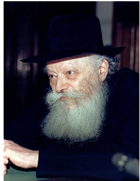
Menachem Mendel Schneerson in 1989