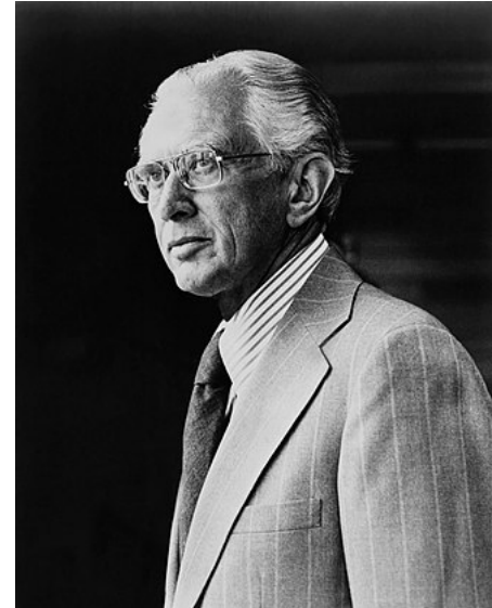
Metzenbaum in 1983