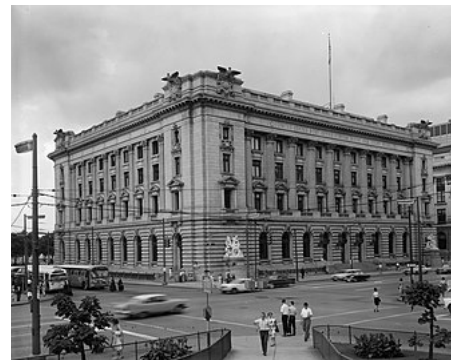
The Old Federal Building and Post Office, now Howard M. Metzenbaum United States Courthouse

On May 27, 1998, the Old Federal Building and Post Office in downtown Cleveland was renamed the Howard M. Metzenbaum United States Courthouse in his honor. [28]