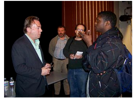
Hitchens after a talk at The College of New Jersey in March 2009

According to Christopher Buckley , before Hitchens died, his estranged friend Sidney Blumenthal wrote to Hitchens. Buckley said the letter contained words of "tenderness and comfort and implicit forgiveness." [179]