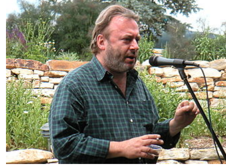
Hitchens in 2005