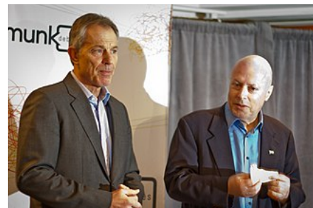
Former British prime minister Tony Blair and Hitchens at the Munk debate on religion, Toronto, November 2010

Richard Dawkins said of Hitchens, "He was a polymath, a wit, immensely knowledgeable, and a valiant fighter against all tyrants, including imaginary supernatural ones." [184] Dawkins later described Hitchens as "probably the best orator I've ever heard", and called his death "an enormous loss". [185]