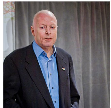
Hitchens in November 2010