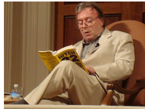
Christopher Hitchens reading his memoir Hitch-22 (2010)