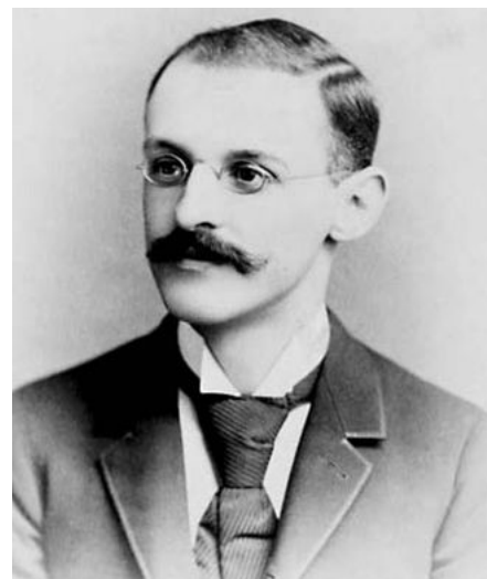
Flexner circa 1895