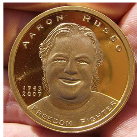
The Aaron Russo Gold Commemorative Memorial Piece.