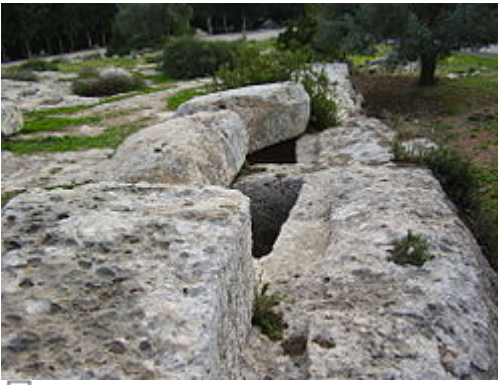
Tombs of the Maccabees, Modi'in , Israel

Key battles between the Maccabees and the Seleucid Syrian-Greeks: