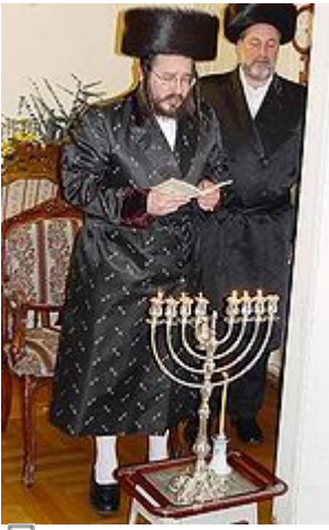
Biala Rebbe lights the menorah