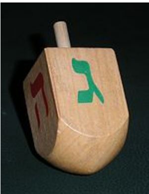
Dreidel with the gimel side up

The dreidel , or sevivon in Hebrew, is a four-sided spinning top that children play with on Hanukkah. Each side is imprinted with a Hebrew letter. These letters are an acronym for the Hebrew words נס גדול היה שם ( Nes Gadol Haya Sham , "A great miracle happened there"), referring to the miracle of the oil that took place in the Beit Hamikdash .