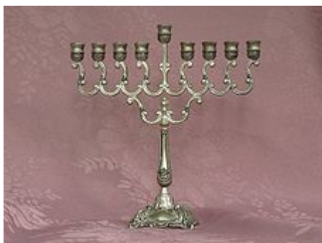
A Hanukkiya or Hanukkah Menorah