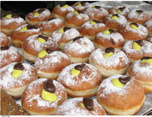
Sufganiyot / doughnuts at a Jerusalem bakery

There is a custom of eating foods fried or baked in oil (preferably olive oil ) to commemorate the miracle of a small flask of oil keeping the flame in the Temple alight for eight days. Traditional foods include potato pancakes , known as latkes in Yiddish , especially among Ashkenazi families. Sephardi, Polish and Israeli families eat jam-filled doughnuts ( Yiddish : פאנטשקעס pontshkes ), bimuelos (fritters) and sufganiyot which are deep-fried in oil. Bakeries in Israel have popularized many new types of fillings for sufganiyot besides the traditional strawberry jelly filling, including chocolate cream, vanilla cream, caramel, cappucino and others. [34] In recent years, downsized, "mini" sufganiyot containing half the calories of the regular, 400-to-600-calorie version have become popular. [35] There is also a tradition of eating cheese products on Hanukkah recorded in rabbinic literature. This custom is seen as a commemoration of the involvement of Judith and women in the events of Hanukkah.