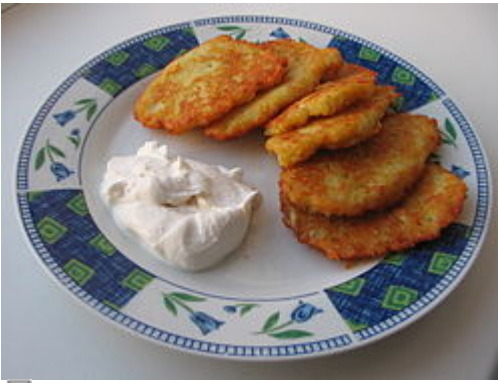
Latkes , a traditional Hanukkah food

The single light each night for eight nights. As a universally practiced "beautification" of the mitzvah , the number of lights lit is increased by one each night. [28] An extra light called a shamash , meaning "attendant" or "sexton," [1] is also lit each night, and is given a distinct location, usually higher, lower, or to the side of the others. The purpose of the extra light is to adhere to the prohibition, specified in the Talmud (Tracate Shabbat 21b–23a), against using the Hanukkah lights for anything other than publicizing and meditating on the Hanukkah story. This differs from Sabbath candles which are meant to be used for illumination. Hence, if one were to need extra illumination on Hanukkah, the shamash candle would be available and one would avoid using the prohibited lights. Some light the shamash candle first and then use it to light the others. [29] So all together, including the shamash , two lights are lit on the first night, three on the second and so on, ending with nine on the last night, for a total of 44 (36, excluding the shamash ).