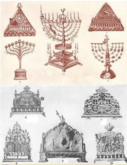
Various menorot used for Hanukkah. 12th through 19th century, CE

The ancient Jewish Historian Flavius Josephus narrates in his book Jewish Antiquities XII, how the victorious Judas Maccabeus ordered lavish yearly eight-day festivities after rededicating the Temple in Jerusalem that had been profaned by Antiochus IV Epiphanes. Josephus does not say the festival was called Hannukkah but rather the "Festival of Lights":