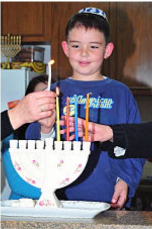
Child lighting Hanukkah candles

The name "Hanukkah" derives from the Hebrew verb "חנך", meaning "to dedicate". On Hanukkah, the Jews regained control of Jerusalem and rededicated the Temple. [3]