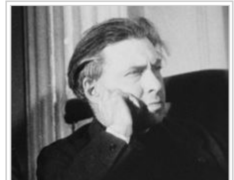
Ilya Ehrenburg in 1943