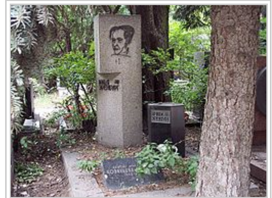
Ilya Ehrenburg's grave with a wire reproduction of his portrait by Picasso