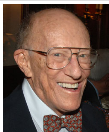
Eisenberg in 2007