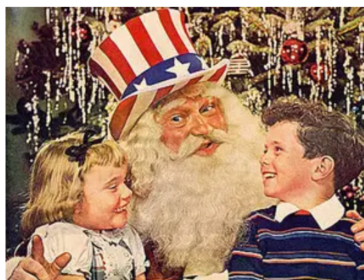
1948 propaganda Santa

The newest version of the National Defense Authorization Act (NDAA) includes an amendment that would legalize the use of propaganda on the American public , reports Michael Hastings of BuzzFeed .