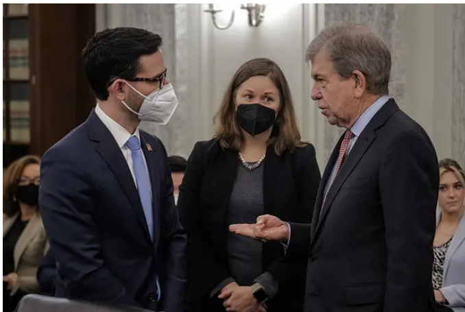
COVID Scams Are Surging, But Congress Isn't Giving The Government Power To Repay Victims