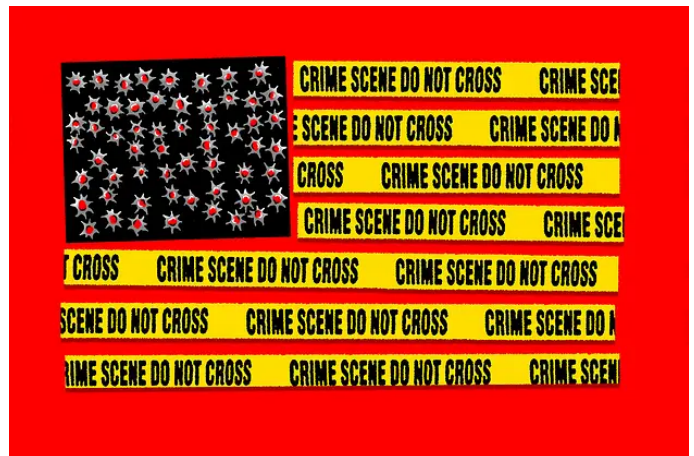
Crime Researchers Say Political Candidates Are Ignoring Evidence As The Midterm Campaigns Heat Up