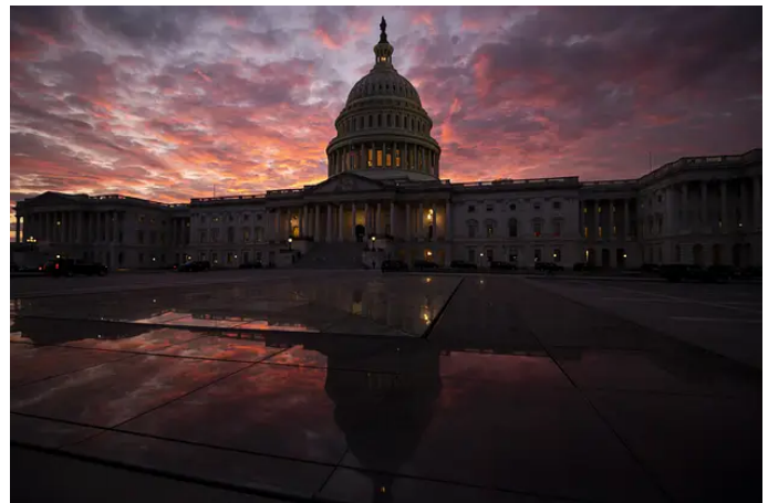
Congress Hit New Levels Of Absurdity This Week