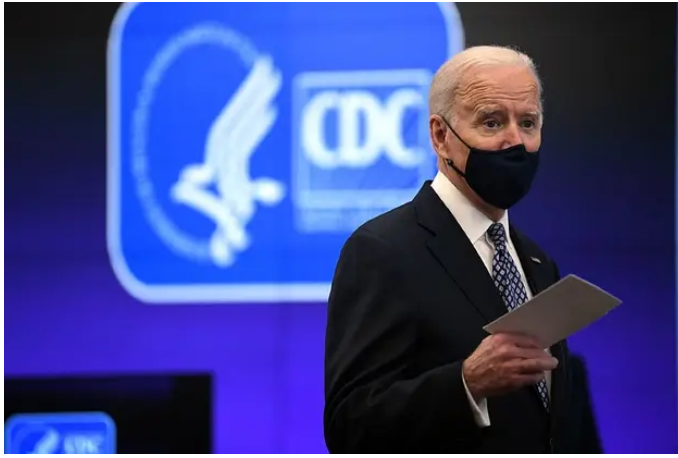
A Possible Senate Change To CDC Leadership Has Public Health Experts Worried