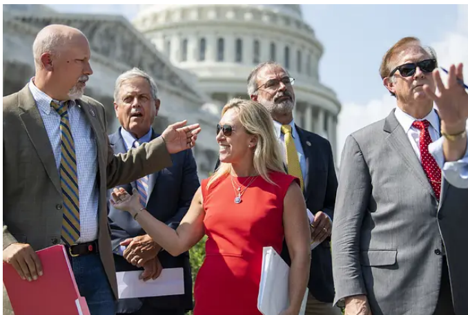
A Group Of Republicans Could Briefly Shut Down The Government Over Vaccine Mandates