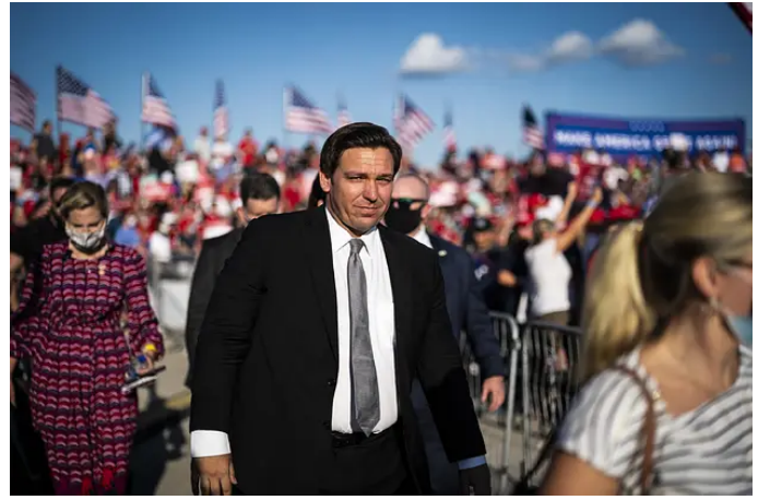
Florida Republicans Are Creating An Office Of Election Crimes As Trump's Fraud Claims Continue To Spread