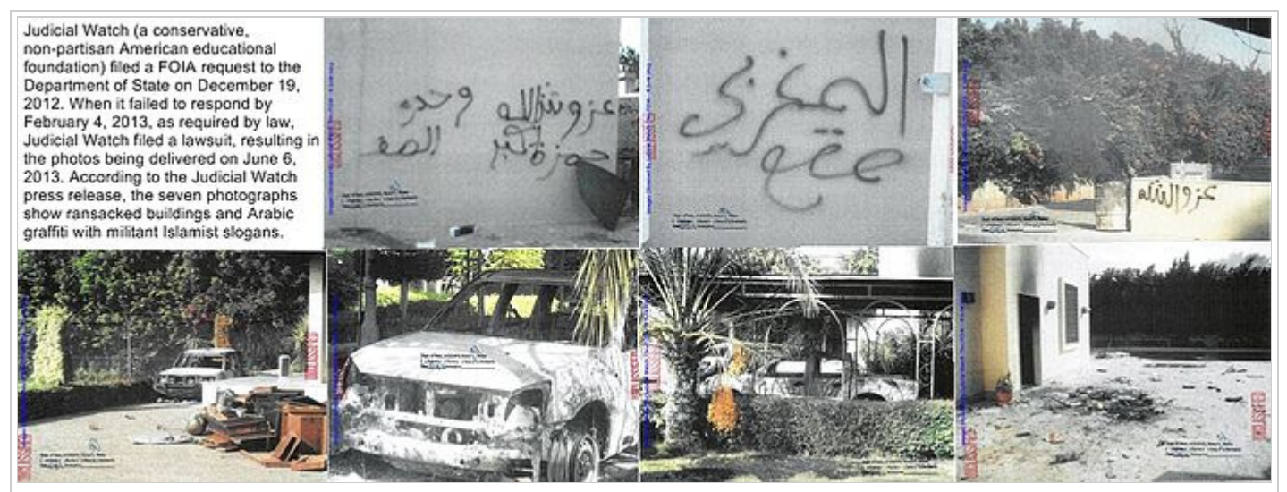
Montage of seven photographs released under a FOIA request to Judicial Watch from the Department of State.

Freedom of Information Act requests have been made since the attack. The conservative foundation Judicial Watch filed a FOIA request to the Department of State on December 19, 2012. An acknowledgement of the request was received by Judicial Watch on January 4, 2013. When the State Department failed to respond to the request by February 4, 2013, Judicial Watch filed a lawsuit, which resulted in seven photographs being