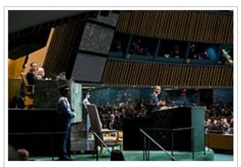
President Barack Obama addresses the United Nations General Assembly

On September 25, in an address before the United Nations General Assembly President Obama stated, "The attacks on our civilians in Benghazi were attacks on America ... And there should be no doubt that we will be relentless in tracking down the killers and bringing them to justice."<sup>[77][191]</sup> He referred to Innocence of Muslims as "a crude and