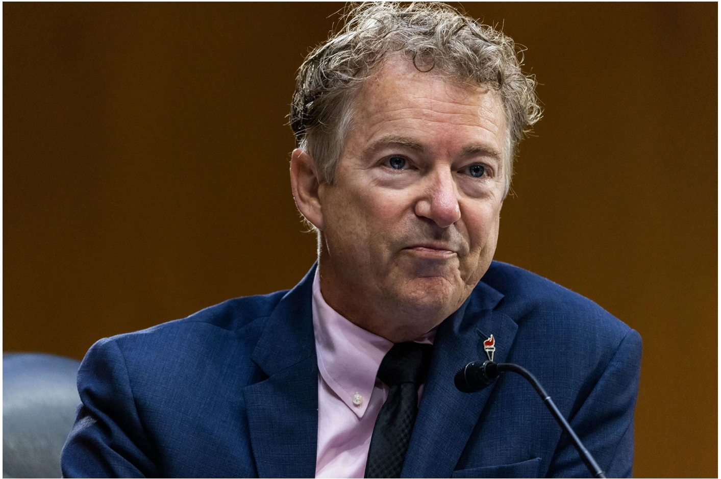
Sen. Rand Paul previously hounded Dr. Anthony Fauci for still recommending people to wear masks after receiving the COVID-19 vaccine.

“Part of the troubling thing that we’re seeing with these emails that are coming out is, not only do they seem to correspond with what President Trump said and what [then-] Secretary [of State Mike] Pompeo said in terms of the origins of the virus,” Meadows said on “Hannity,” but it indicates that Dr. Fauci had knowledge, or at least a suspicion, of things not happening in an evolutionary manner very early on, and he didn’t share that ... That’s very troubling and something that we do need to get to the bottom of.”