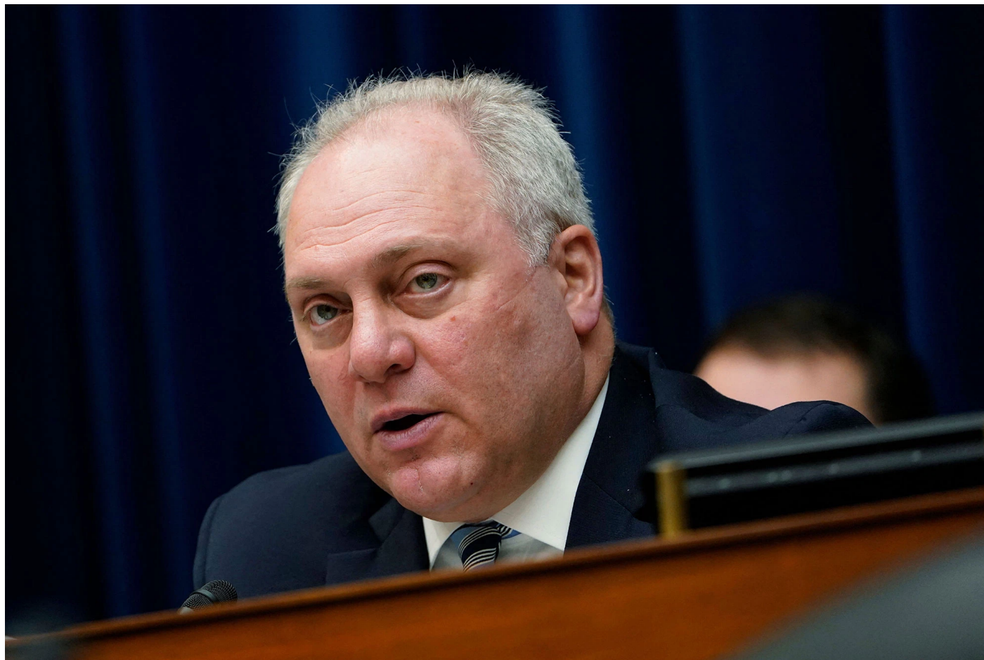
House Minority Whip Steve Scalise questions Facebook's role in censoring news information on the origins of COVID-19.