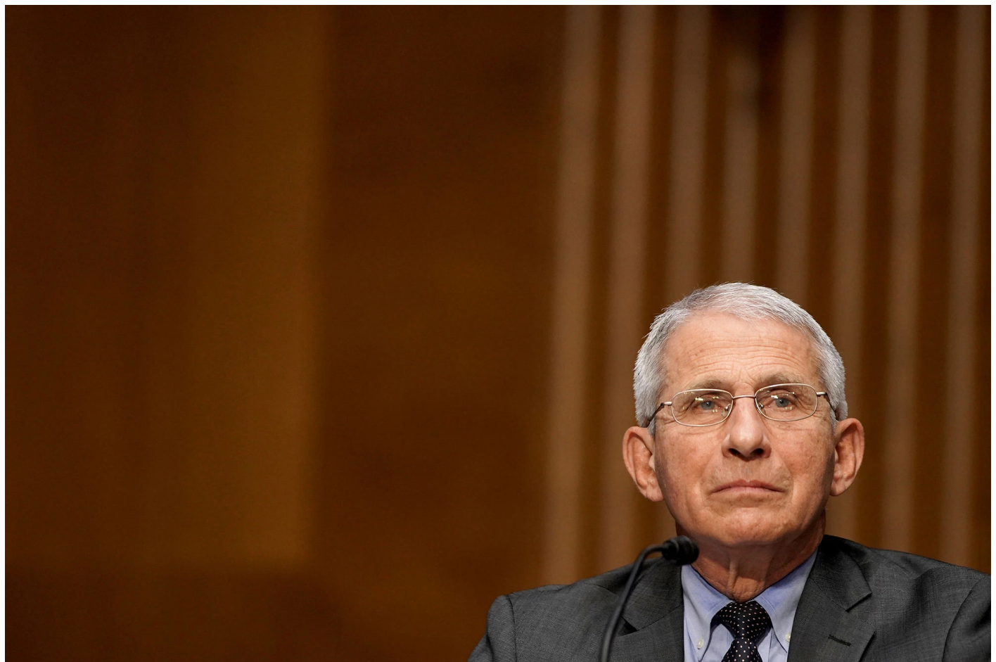
Several lawmakers are questioning Dr. Anthony Fauci’s role at investigating the origins of COVID-19.

“He needs to be FIRED!” Greene followed that tweet by posting an image of herself wearing a black mask bearing the words “Fire Fauci.”