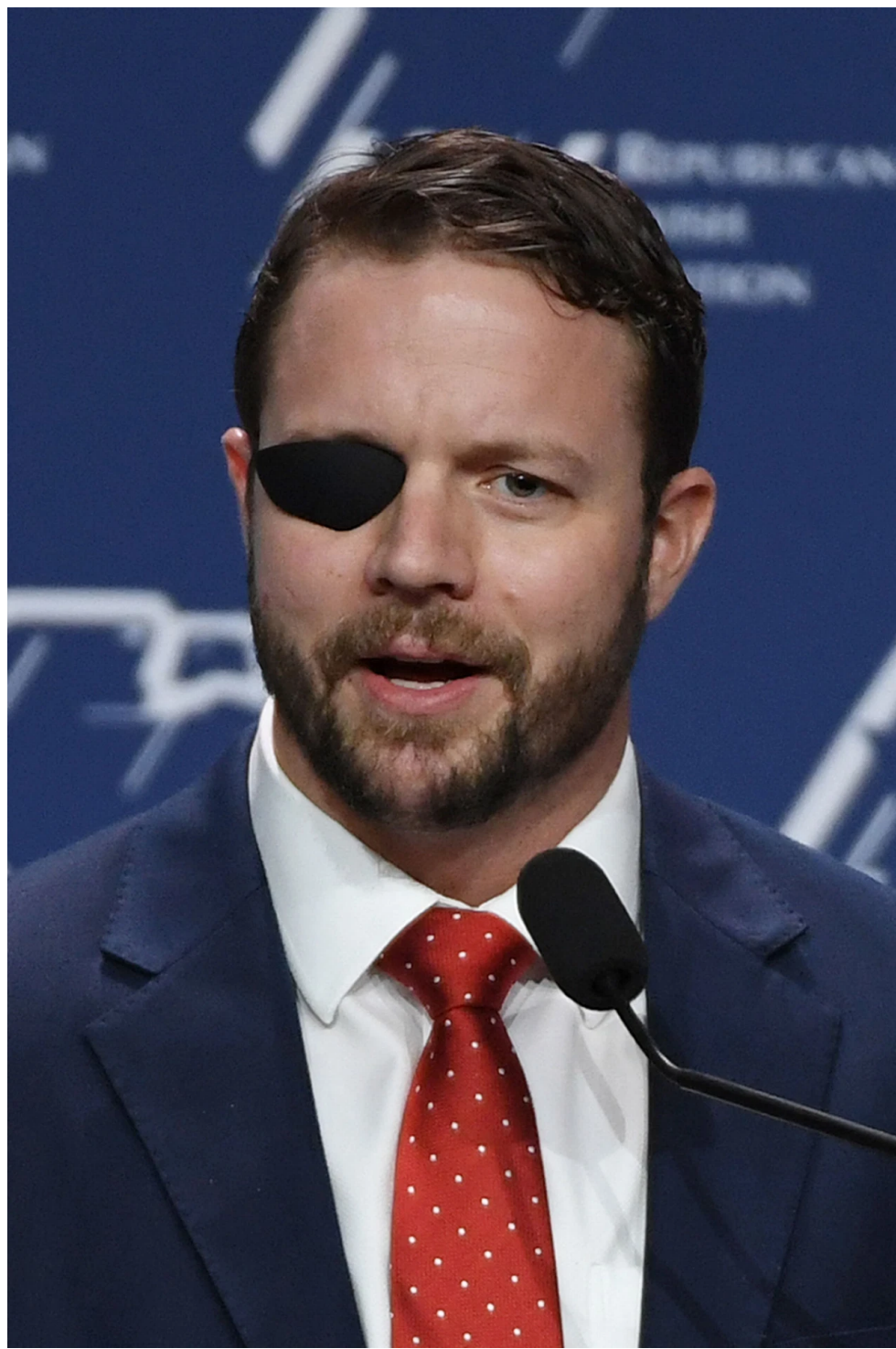
Rep. Dan Crenshaw supports President Donald Trump's decision to move a US embassy to Jerusalem during the Republican Jewish Coalition's annual leadership meeting in Las Vegas, Nevada on April 6, 2019.