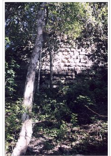
Exposed stonework at El Mirador in 2000