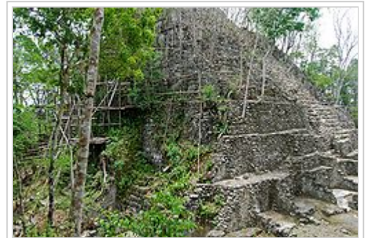
Pyramid at El Mirador