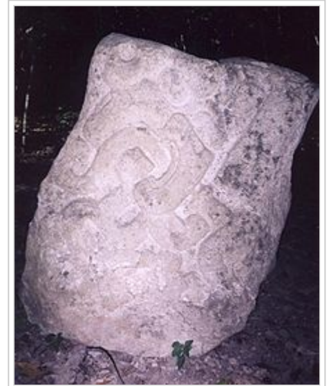
Stela 2 at El Mirador. [3]

There are a number of "triadic" structures (around 35 structures), [4] consisting of large artificial platforms topped with a set of 3 summit pyramids. The most notable such structures are three huge complexes; one is nicknamed "El Tigre", with height 55 metres (180 ft); the other is called "La Danta" (or Danta) temple. The La Danta temple measures approximately 70 metres (230 ft) tall from the forest floor, [5] and considering its total volume (2,800,000 cubic meters) is one of the largest pyramids in the world. [6] When the large man-made platform that the temple is built upon (some 18,000 square meters) is included in calculations, La Danta is considered by some archeologists to be one of the most massive ancient structures in the world. [7] Also the "Los Monos" complex is very large (48 meters high) although not as well known. Most of the structures were originally faced with cut stone which was then decorated with large stucco masks depicting the deities of Maya mythology. According to Carlos Morales-Aguilar, a Guatemalan archaeologist, the city appears to have been planned from its foundation, as extraordinary alignments have been found between the architectural groups and main temples, which were possibly related to solar alignments. The study reflects an importance of urban planning and sacred spaces since the first settlers.