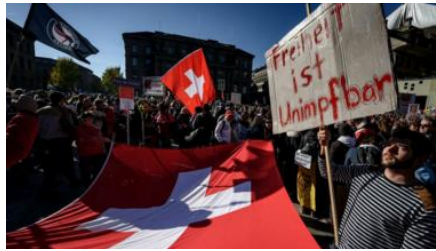
Swiss vote on ending restrictions amid Covid surge