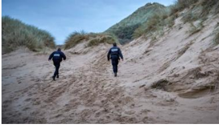
The Channel beaches that host a lethal trade in human hope