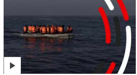
Ros Atkins on... Migrant Channel crossings