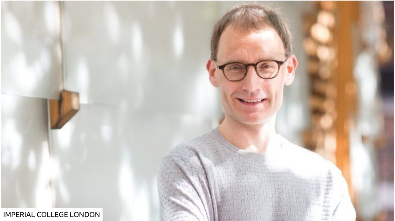
IMPERIAL COLLEGE LONDON