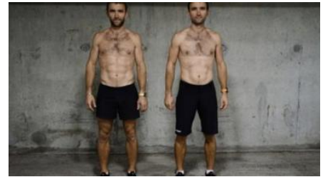
Is a vegan diet healthier than eating meat and dairy?