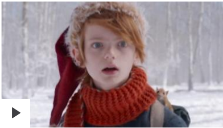
Brad Pitt, Santa Claus and me: An author's tale