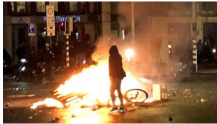
Conspiracy and untruths drive Europe's Covid protests