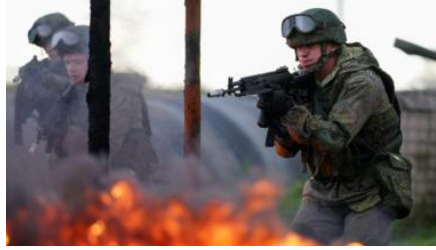
Why Russia is stoking border tensions with Ukraine