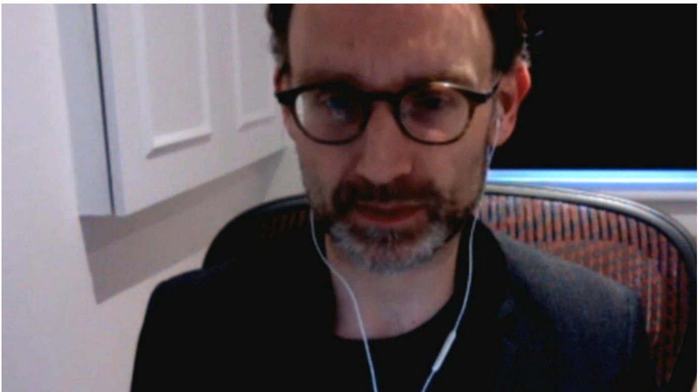
| Prof Neil Ferguson appeared before the Science and Technology Committee in March

"I deeply regret any undermining of the clear messages around the continued need for social distancing."