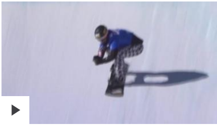
Winter Olympians get ready for Games in Beijing