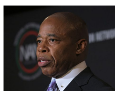
https://www.visiontimes.com/2022/04/21/ny-governor-asks-union-to-reject-adams-proposal.html NY Gov Asks Union to Reject Adams Proposal https://www.visiontimes.com/2022/04/21/ny-governor-asks-union-to-reject-adams-proposal.html