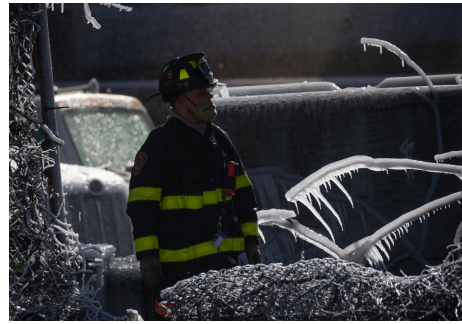
Firefighters battle a fire at a food processing plant in Florida, New Jersey, on January 30, 2021. Multiple US food processing facilities have been hit with fires or other disasters in the last 30 days

https://twitter.com/intent/tweet?text=A%20string%20of%20fires%20destroys%20food%20processing%20facilities%20across%20america&url=https://www.visiontimes.com/2022/04/21/sires-destroy-food-processing-facilities-across-america/