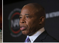
https://www.visiontimes.com/2022/04/21/ny-governor-asks-union-to-reject-adams-proposal.html NY Gov Asks Union to Reject Adams Proposal https://www.visiontimes.com/2022/04/21/ny-governor-asks-union-to-reject-adams-proposal.html