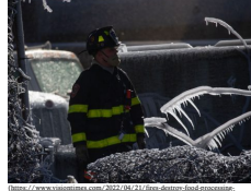
https://www.visiontimes.com/2022/04/21/fires-destroy-food-processing-facilities-across-america.html A String of Fires Destroys Food Processing Facilities Across America https://www.visiontimes.com/2022/04/21/fires-destroy-food-processing-facilities-across-america.html