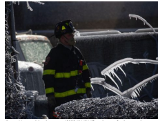
https://www.visiontimes.com/2022/04/21/fires-destroy-food-processing-facilities-across-america.html A String of Fires Destroys Food Processing Facilities Across America https://www.visiontimes.com/2022/04/21/fires-destroy-food-processing-facilities-across-america.html