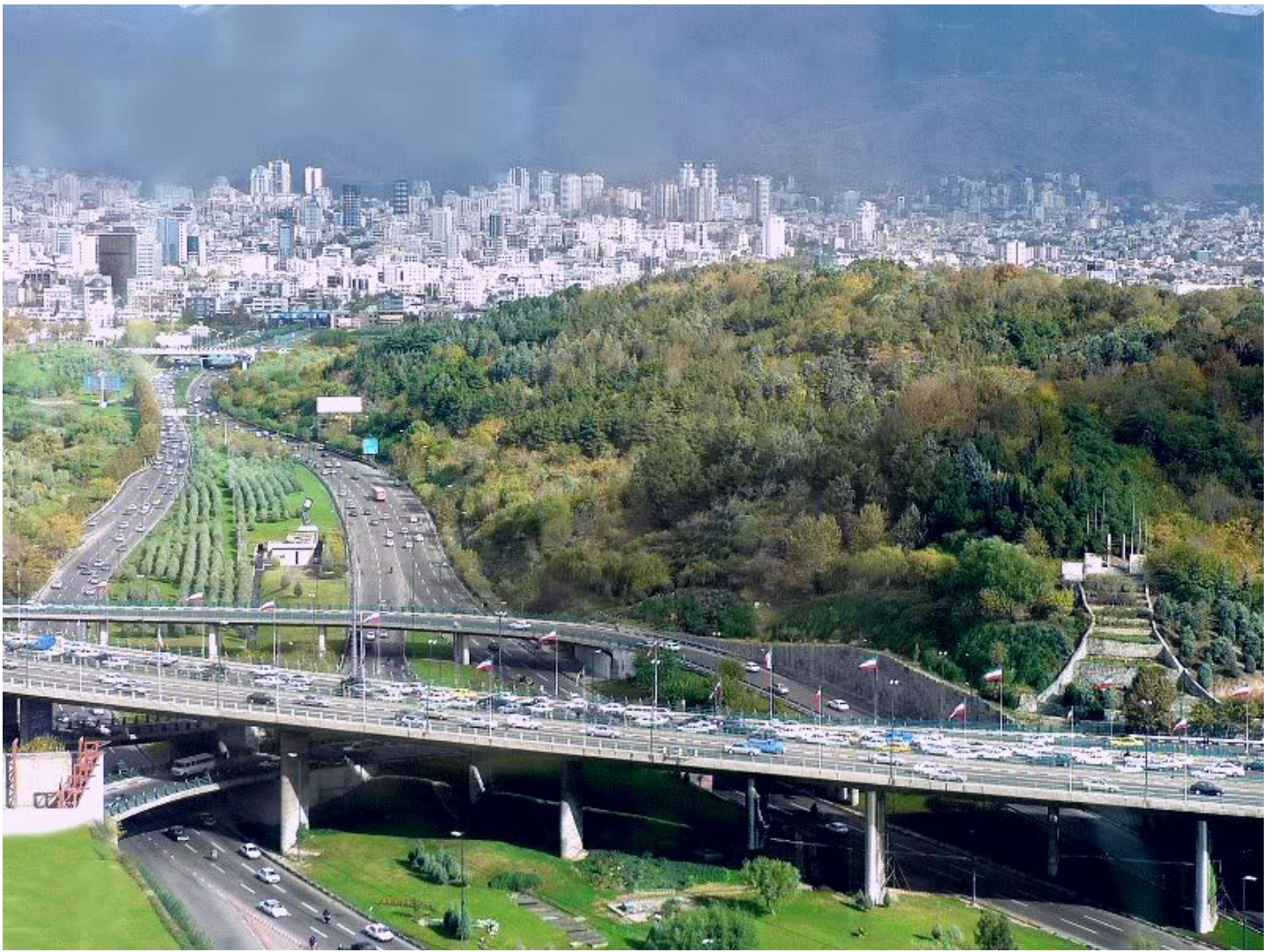
Another Iranian city