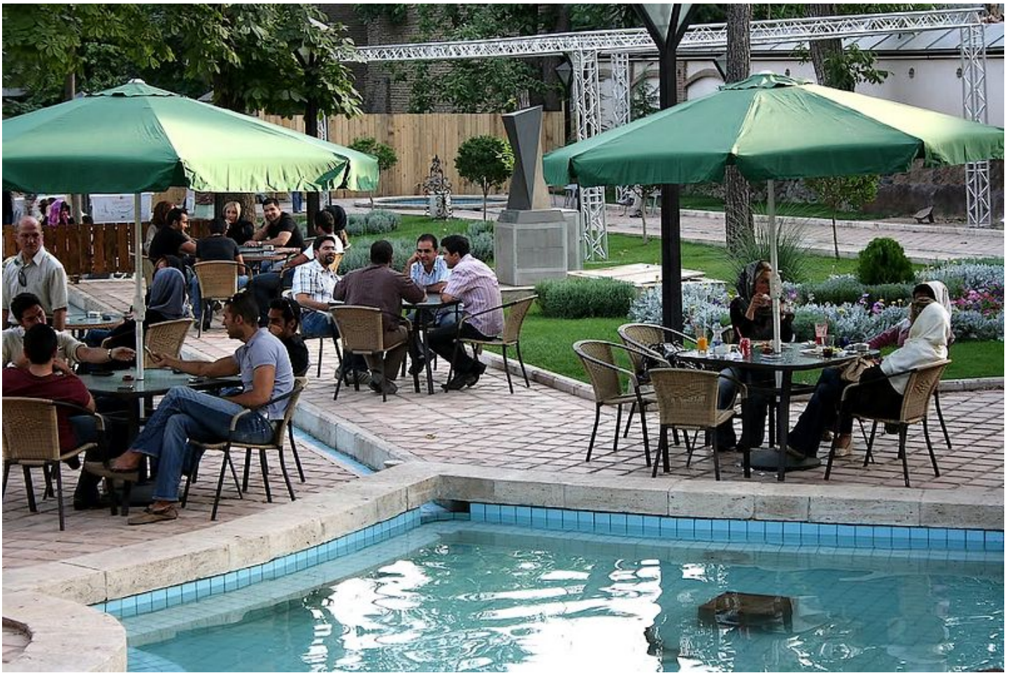
Here are the "tents" they live in.