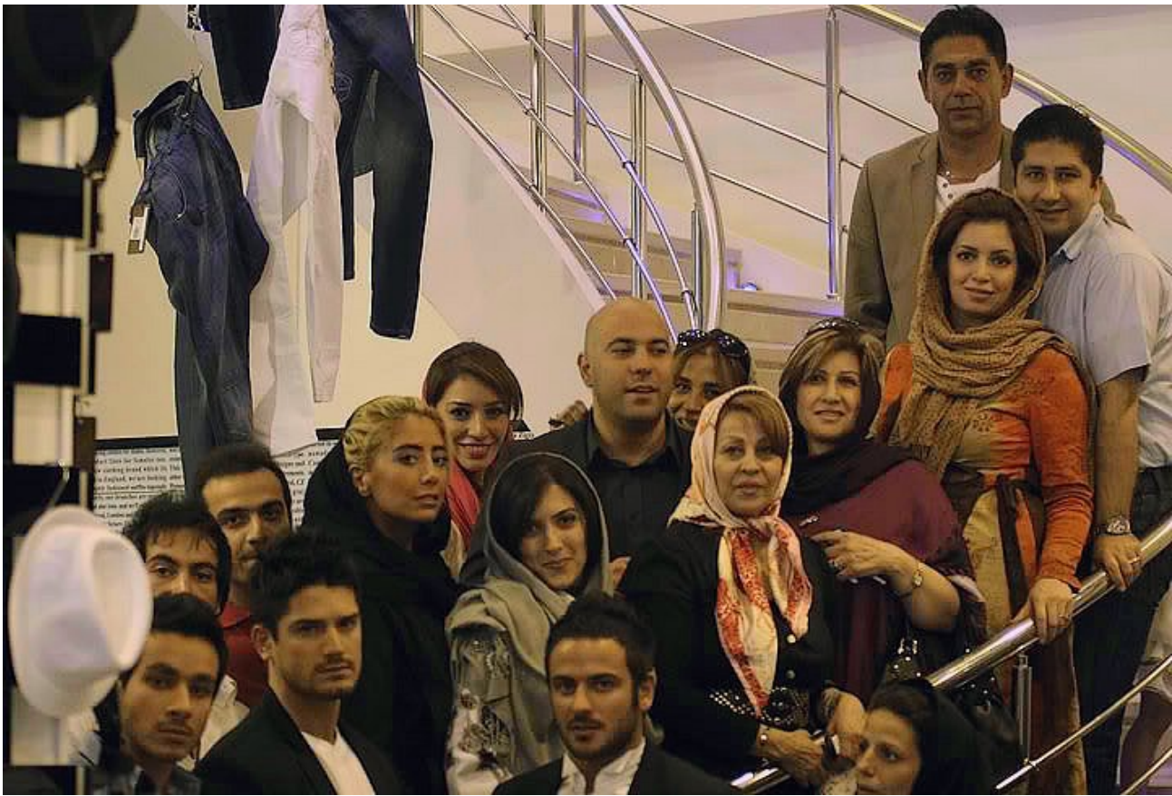
This is another major Iranian city