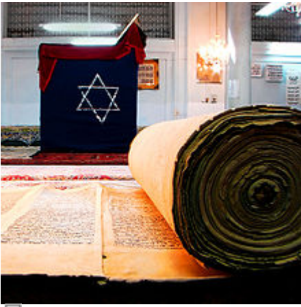
Mullah Jacob's Synagogue in Esfahan

Iran's Jewish community is officially recognized as a religious minority group by the government, and, like the Zoroastrians , they are allocated one seat in the Iranian Parliament . Ciamak Moresadegh is the current Jewish member of the parliament, replacing Maurice Motamed in the 2008 election. In 2000, former Jewish MP Manuchehr Eliasi estimated that at that time there were still 30,000–35,000 Jews in Iran, most other sources put the figure at 25,000. [54] The United States State Department estimated the number of Jews in Iran at 20,000–25,000 as of 2009. [55]