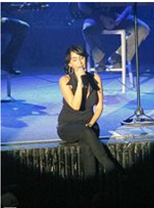
Rita Kleinstein , an Israeli pop-star, of Persian descent