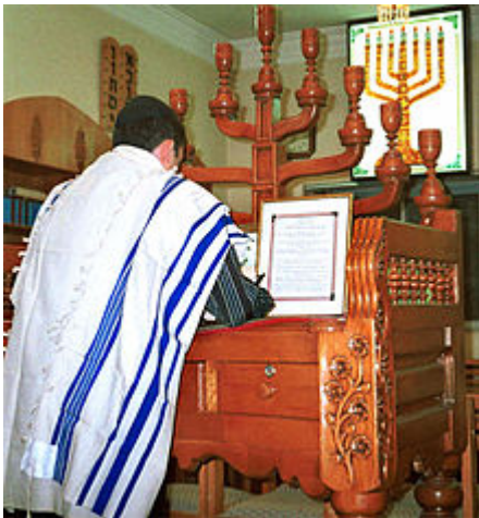
A Persian Jew prays in a synagogue in Shiraz , Iran.

Rabbis from the Haredi sect Neturei Karta , which has historically been opposed to the existence of Israel have visited Iran on several occasions. [69][70][71][72] The Jewish Defense Organization , protested against one such visit by members of a Neturei Karta faction after they attended International Conference to Review the Global Vision of the Holocaust in Tehran.