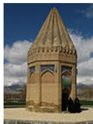
The shrine of Habakkuk in Toyserkan .