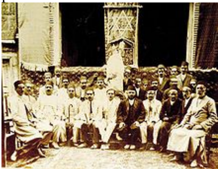
Hamedan Jews in 1918