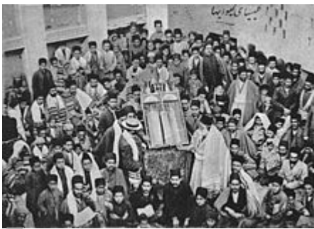
Synagogue in Tehran. A postcard from the Qajar (1794–1925) period.