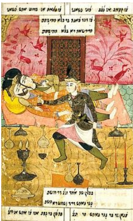
Hebrew version of Nizami 's "Khosrow va Shirin".

By the early Third Century, Persian Empire influences were on the rise again. In the winter of 226 CE, Ardashir I overthrew the last Parthian king ( Artabanus IV ), destroyed the rule of the Arsacids, and founded the illustrious dynasty of the Sassanids . While Hellenistic influence had been felt amongst the religiously tolerant Parthians , [25] [26] [27] the Sassanids intensified the Persian side of life, favored the Pahlavi language, and restored the old monotheistic religion of Zoroastrianism which became the official state religion . [28] This resulted in the suppression of other religions. [29] A priestly Zoroastrian inscription from the time of King Bahram II (276–293 CE) contains a list of religions (including Judaism, Christianity, Buddhism, Hinduism etc.) that Sassanid rule