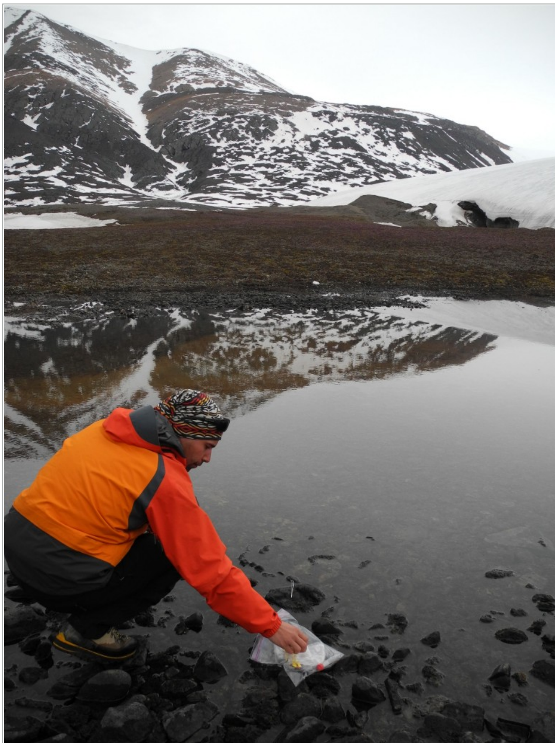
Team member taking samples near the glacier where the message in a bottle was found

person who finds it to re-measure the distance to the glacier and report back to the research team.