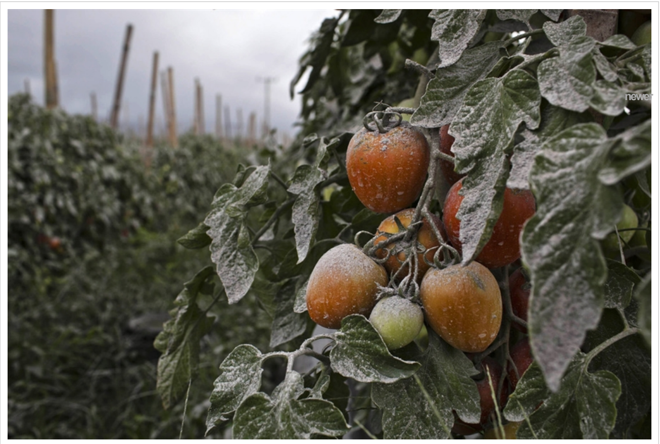
A farmer examines his tomato crop.