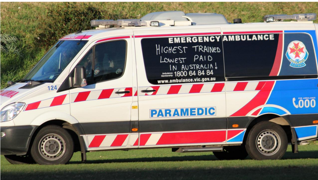
Chaos as four flee burning car