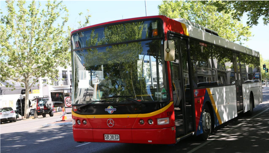
'Unacceptable': Return to work chaos