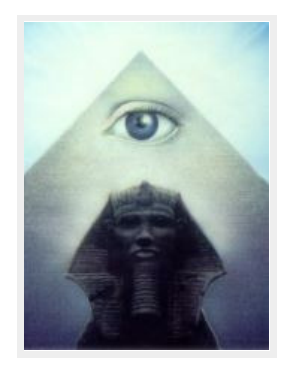
Jay Dyer 21st Century Wire