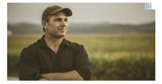
Expert breaks his silence You'll never realize how bad the U.S. economy is until you read the Learn more

Now I'm not going to claim to know what really happened here, but we are being lied to, and lies like this mean trouble is coming.