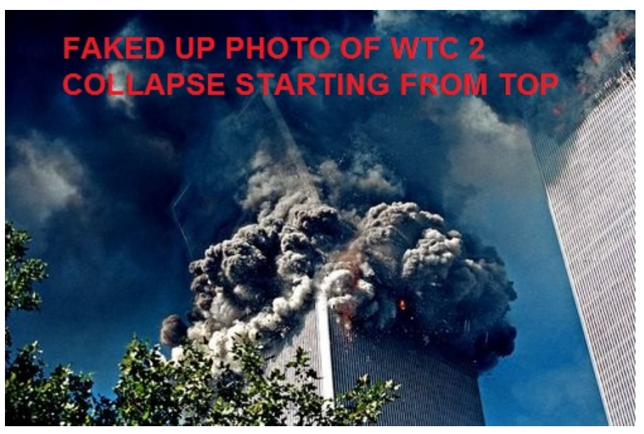
Photo by Thomas Nilsson - The above initiation of the destruction of WTC2 on 911, i.e. top part tilting and dropping, smoke and debris being ejected, etc., is not possible because <u>structures cannot break down like that ... by gravity</u>. The photo, incl. tree in front, building right, smoke glued to a tilting top in center, etc, is a <u>fake</u> (produced in Hollywood). <u>Thomas Nilsson should be detained as a covered person!</u>